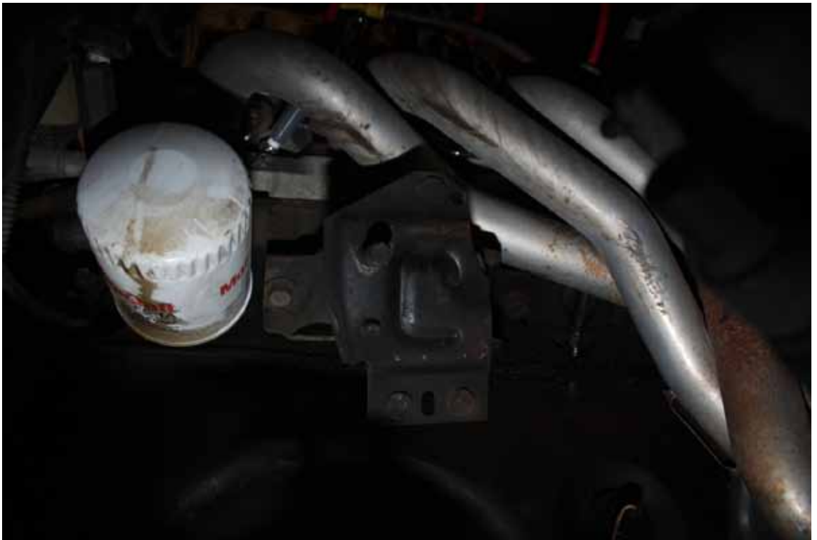
5. Remove the 2 bolts holding the mount to the engine.

4. Use an engine support beam or a piece of wood on a floor jack to raise the engine high enough to get the motor mount stud out of the kmember.