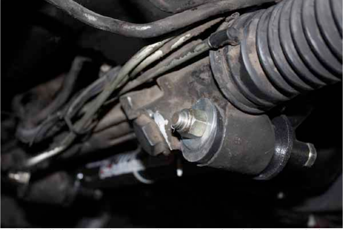
29. Install the new bushings into the steering rack and slide it onto the k-member. A little grease and a couple of c-clamps may be needed to get

28. Install sway bar link into the control arms.