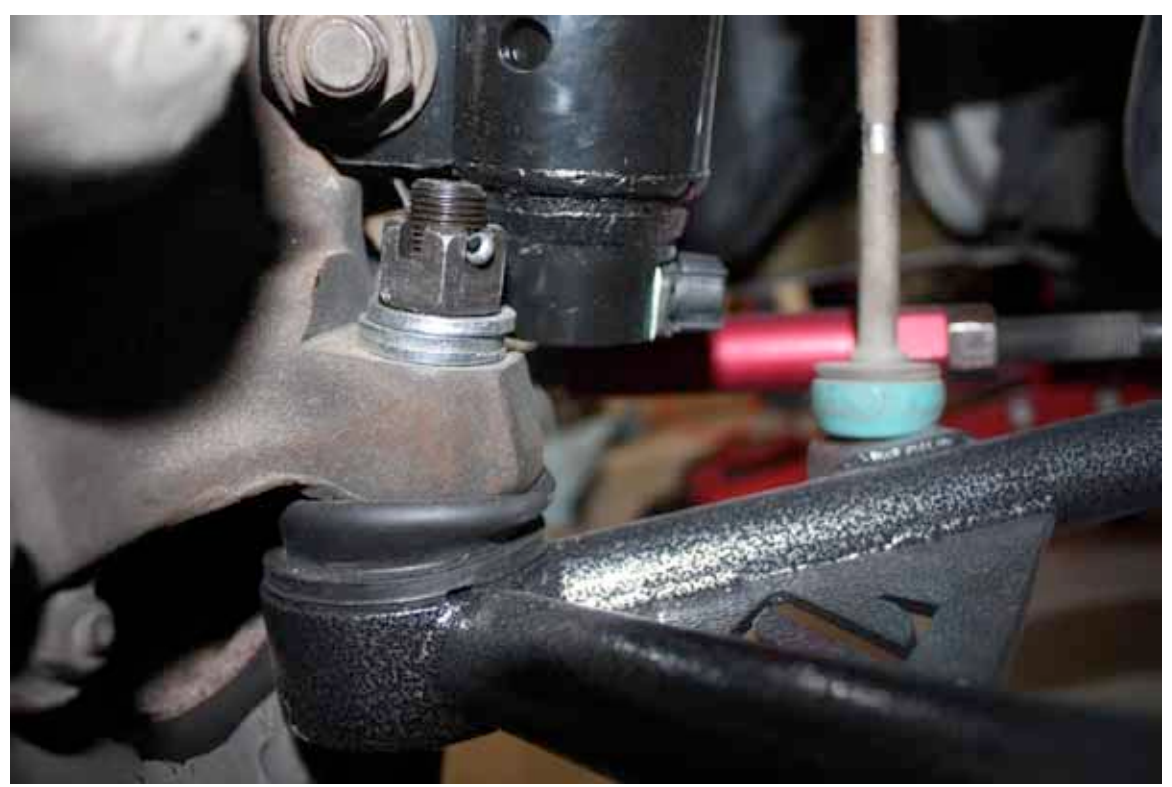
27. Install the ball joint into the spindle and put on the nut and cotter key. Install tie rod into the steering arm of the spindle also.

28. Install sway bar link into the control arms.