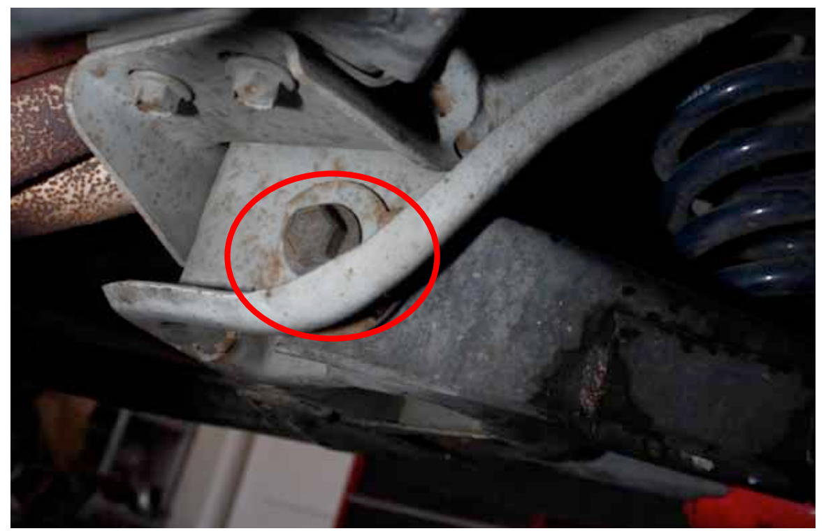
REAR CONTROL ARM BOLT