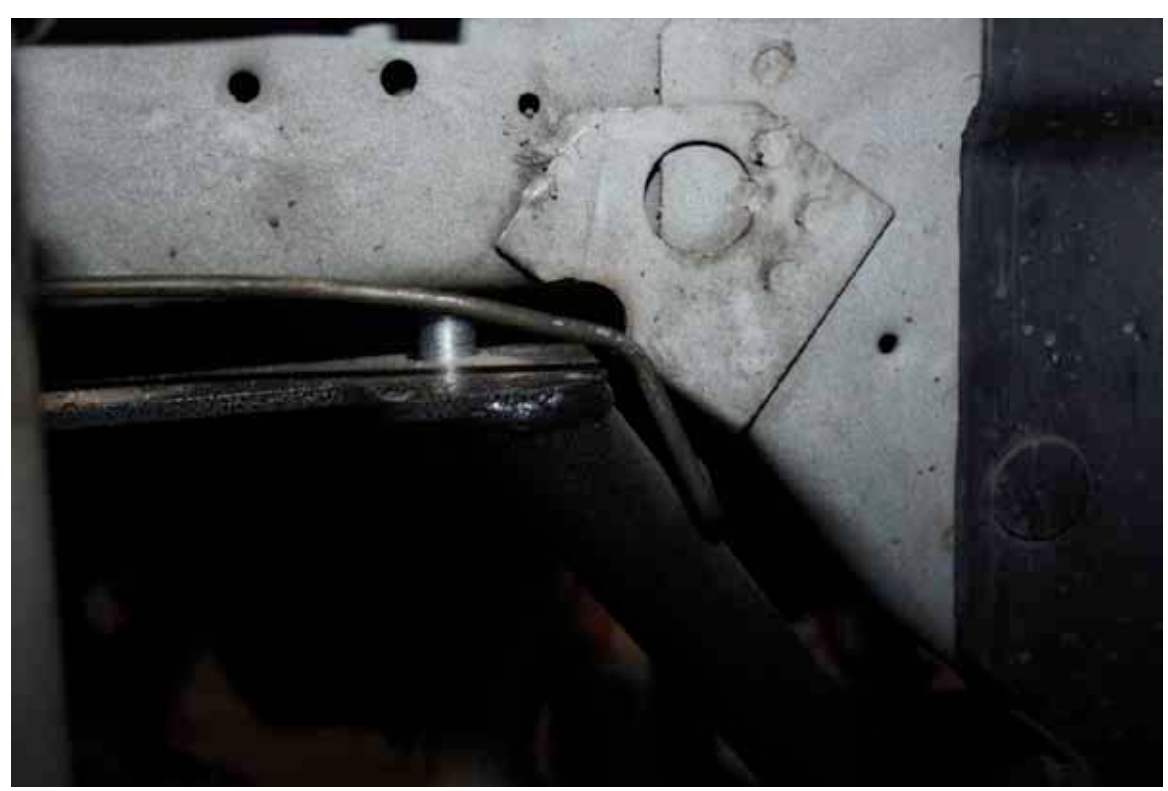
23. Check the clearance at the rear of the flanges there it lays on the frame rail. You may need to clearance the angle brackets at the rear.