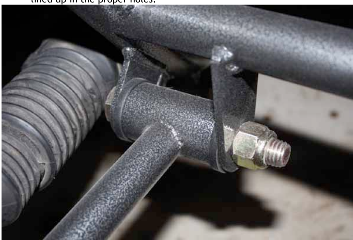
26. Install lower control arms. Make sure the front bolt does not stick out to the front and rub on the steering rack.

25. The engine can be lowered down slowly. Get the motor mount studs lined up in the proper holes.