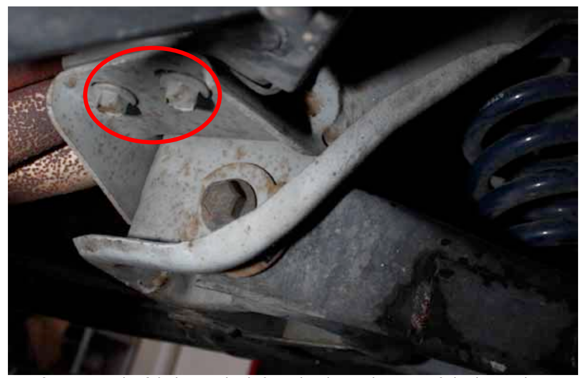
18. Remove the 2 bolts on the left and right at the rear of the k-member.